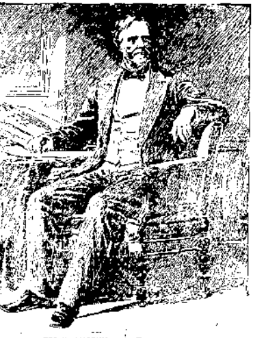
NOT WANTED IN AMERICA.

John Sherman, former Republican senator from Ohio, died at his home in New York City at the age of 82. He was the 28th chief justice of the United States.